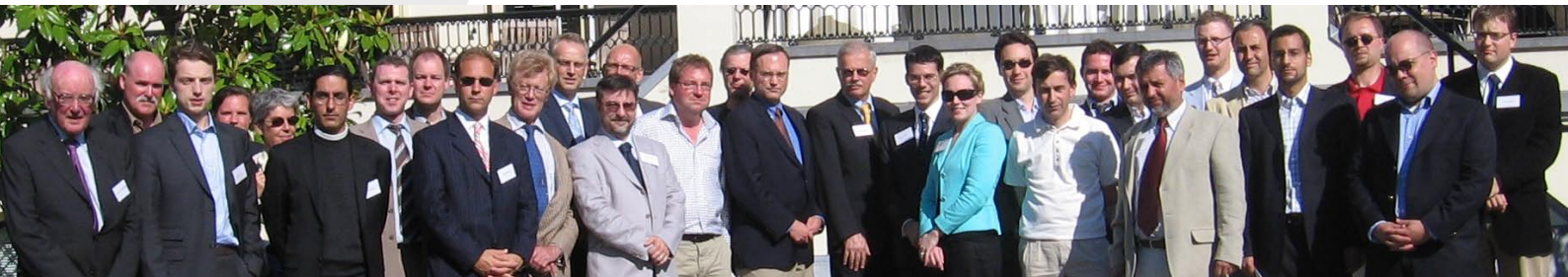
Group picture of the first annual Vanenburg meeting in 2006

July 4th - 6th in Madrid, Spain: Forty Years of the Spirit of '68: Is Europe in Crisis?