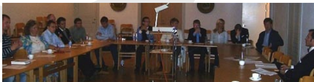
The KF summer conference of 2007

The initial summer conference was the first national gathering of classical conservatives in Sweden in more than two decades. This is partly due to the fact that until about fifteen years ago Moderata Samlingspartiet has been the reliable homestead of conservatives. Moreover, several earlier attempts at organizing Swedish conservatism have failed to keep the right-wing extremists out, and thus never have achieved enough legitimacy to hold a large-scale conservative gathering. Since the beginning, confidence and legitimacy have been the guiding stars for KF. In addition to annual conferences, since 2005 KF has been holding seminars.